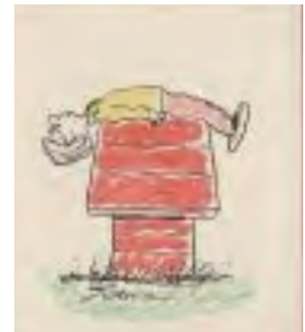
A self-caricature by Charles Schulz

Known as Sparky to his family and friends, Schulz single-handedly created 17,897 Peanuts comic strips during a span of almost 50 years. At the time of his retirement in 1999, Peanuts ran in more than 26,000 newspapers and was translated into 21 languages in 75 countries with a daily readership estimated to be 355 million. Peanuts was a worldwide cultural phenomenon in the last half of the 20th century.