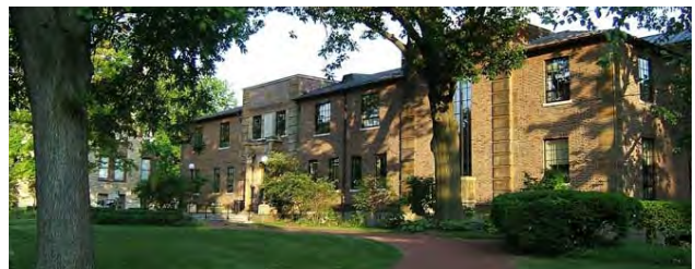
The Columbus Torch Club has met in Ohio State's Faculty Club building since it opened in 1939.