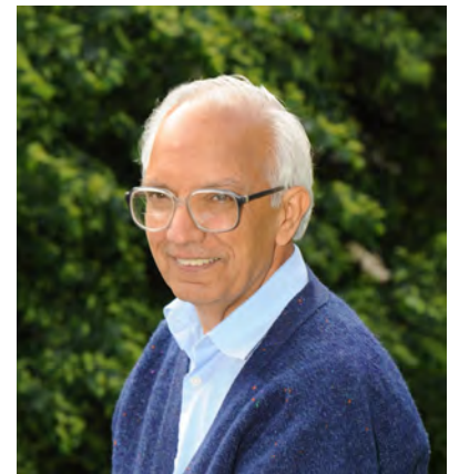
Rattan Lal, Distinguished University Professor of Soil Science at Ohio State University.